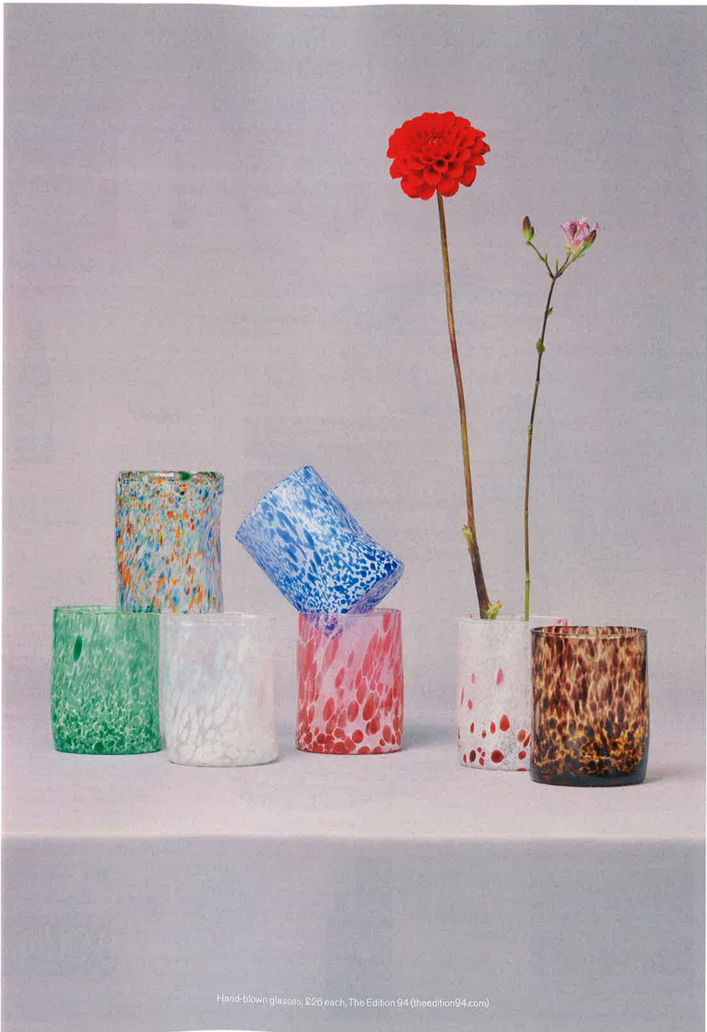
Hand-blown glasses, £26 each, The Edition 94 ( theedition94.com )