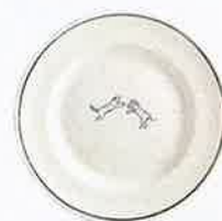
↑ Porcelain plate, £28, Laura Carlin (thenewcraftsmen.com)