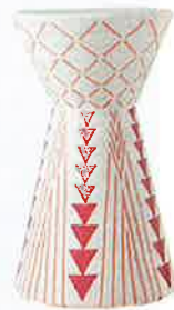
↑ Glazed earthenware stool, £128, Anthropologie (anthropologie.com)