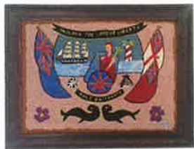
↑ England Land of Liberty artwork in wool, £400, Colin Millington (paffronandscott.co.uk)