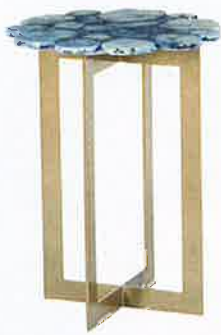
↑ Agate and brass side table, £295, Andrew Martin (andrewmartin.co.uk)