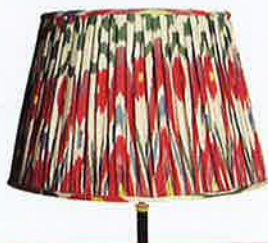
↓ Linen lampshade, £111, Pooky (pooky.com)