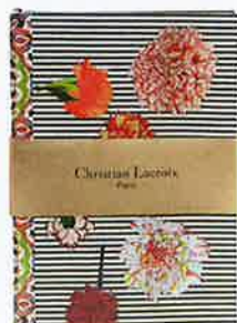
← Notebook, £13, Christian Lacroix (designersguild.com)