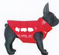
↑ Nylon dog coat, £285, Moncler (moncler.com)