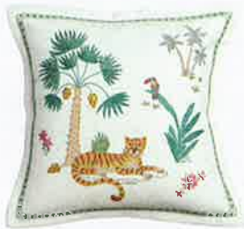
↑ Hand-embroidered cushion, £86, Chelsea Textiles (chelseatextiles.com)