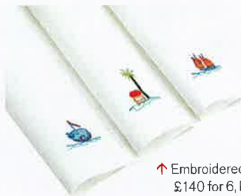
↑ Embroidered placemats, £140 for 6, Kit Kemp (firmdalehotels.com)