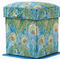
↑ Fold-out sewing kit, £19.95, Liberty London (libertylondon.com)