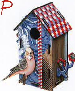
↑ Wall hanging, £45, Miho Unexpected, V&A (vam.ac.uk)