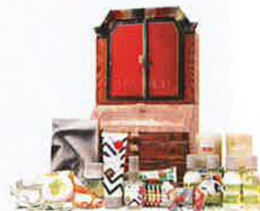
↑ Mini bureau filled with Kit Kemp stationery, Rikrak toiletries and a silk pocket square, £225, Firmdale Hotels (firmdalehotels.com)