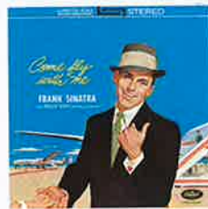
↑ Vinyl record, £14.99, Frank Sinatra (recordstore.co.uk)