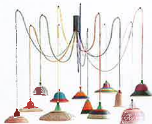
↑ Ceiling light, £3,287, Alvaro Catalán de Ocón (pamono.co.uk)