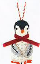
↑ Handmade Christmas decoration, £22, Fine Cell Work (finecellwork.co.uk)